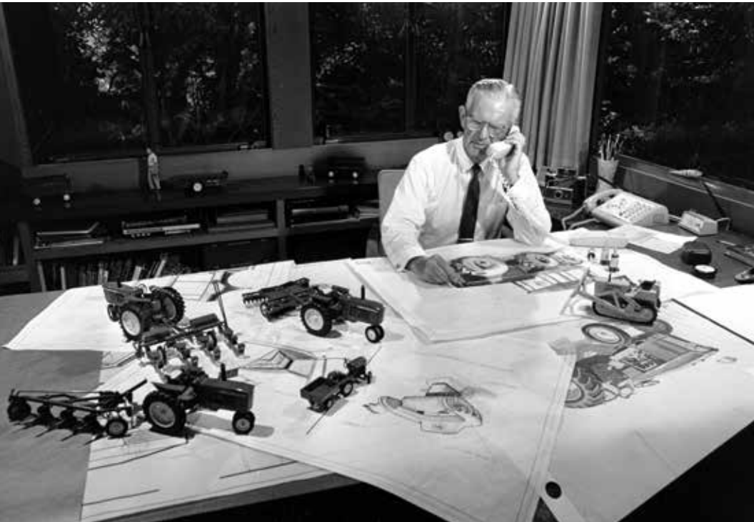
Henry Dreyfuss in his office with John Deere designs, circa 1966